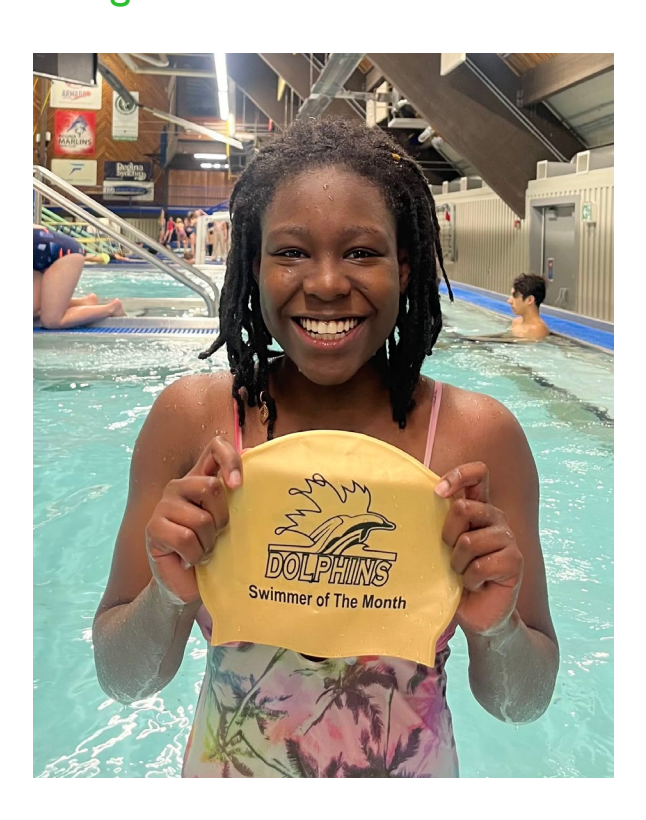
Prospect Silver Congratulations Vishi